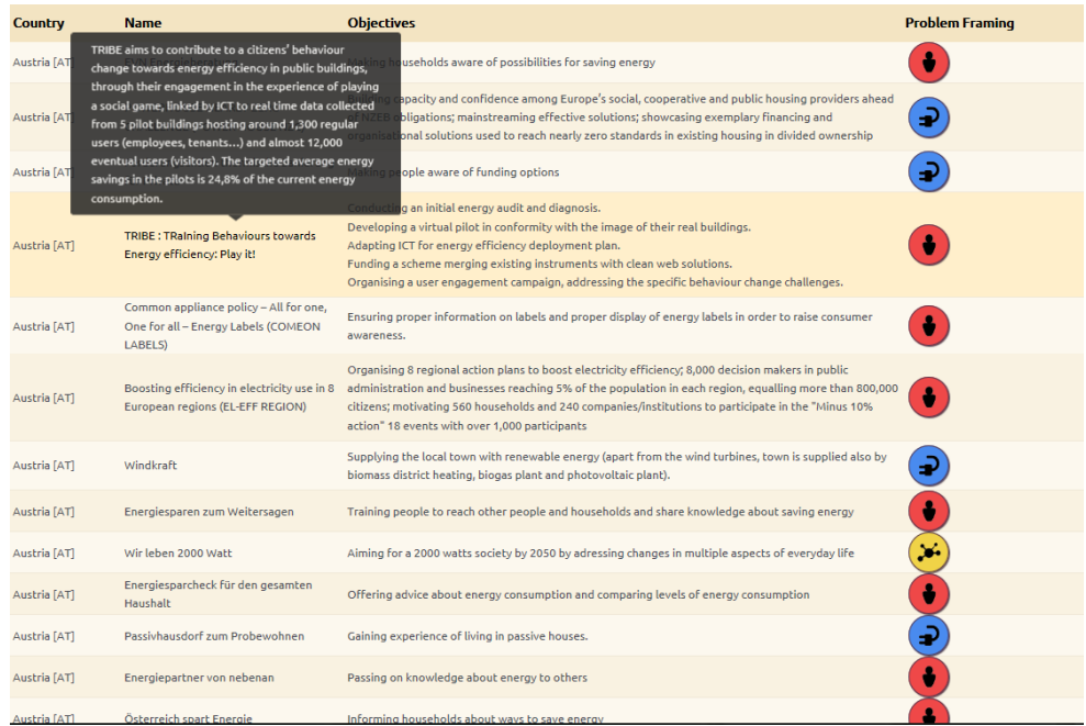
Figure 3 Open Access Database - Scrolling List of SECIs

When the user has scrolled down, a list of SECIs within the selected country is shown. If the user scrolls down below the map without first choosing a country, a full list of all identified 1000+ SECIs will be shown. By pressing/hovering over the Name of the SECI, a short description of the SECI will appear. Next to the Name, the Objectives of the SECI are featured. On the right hand side of the list, icons indicate under which category each SECI has been listed according to the Problem Framing Typology.