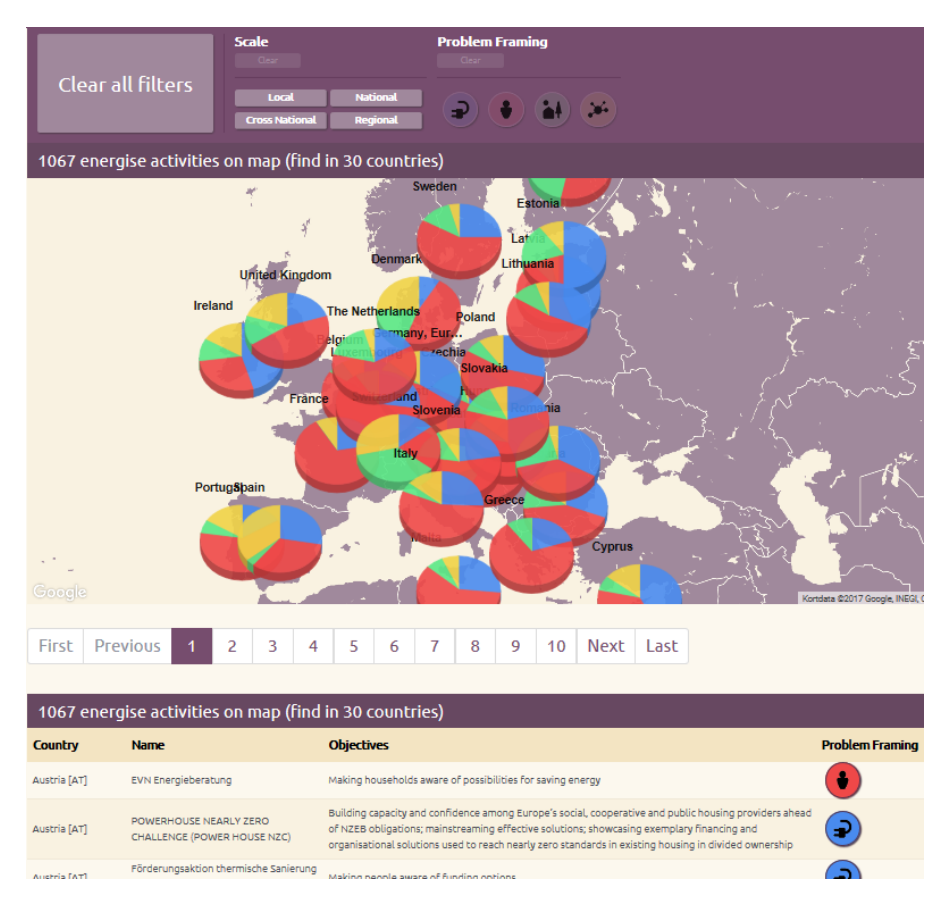
Figure 1 Overview of ENERGISE Open Access Dataset of SECIs

The Open Access Dataset is searchable in such a way that the user can filter the SECIs according to 1) Scale, and 2) the Problem Framing (PFT). For a visual example of the Open Access Dataset, what data is featured and how, see Figure 1.