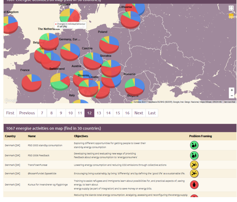
Figure 2 Open Access Database - selecting by country

In the example in figure 2, the selected country is Denmark, and 36 identified SECIs are shown. If you click on the country name, a list of the results for the selected country appears. This list is shown below the map and the user can scroll down to learn more about each SECI.