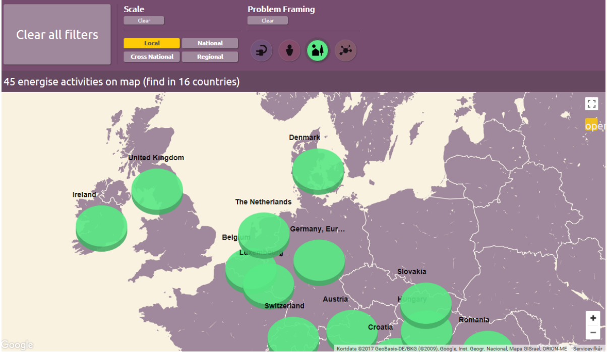
Figure 4 Open Access Database - example of using filters

consumption, s/he can filter Local in Scale and Changes in Everyday Life Situations in Problem Framings.